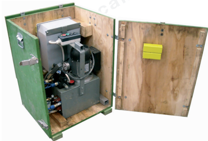
HYDRAULIC CONTROL UNIT