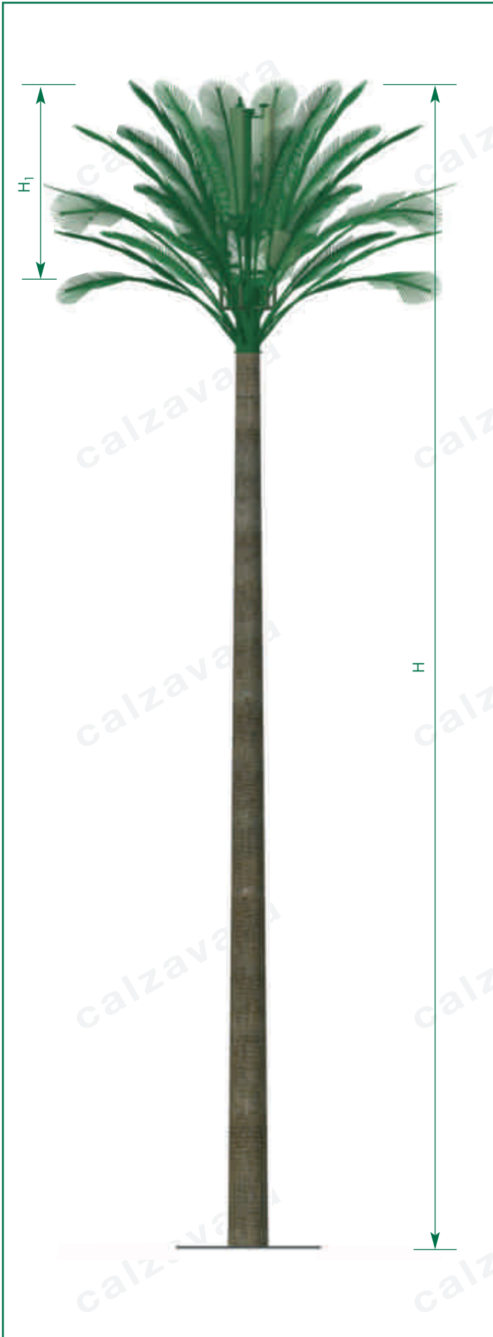
date palm scheme

All legal rights in this document are the exclusive property of calzavara and no part of it may be reproduced or communicated to any other party without our authorization. All data in this catalogue is for reference only and may be changed without notice, in line with our policy of continuous technical development.